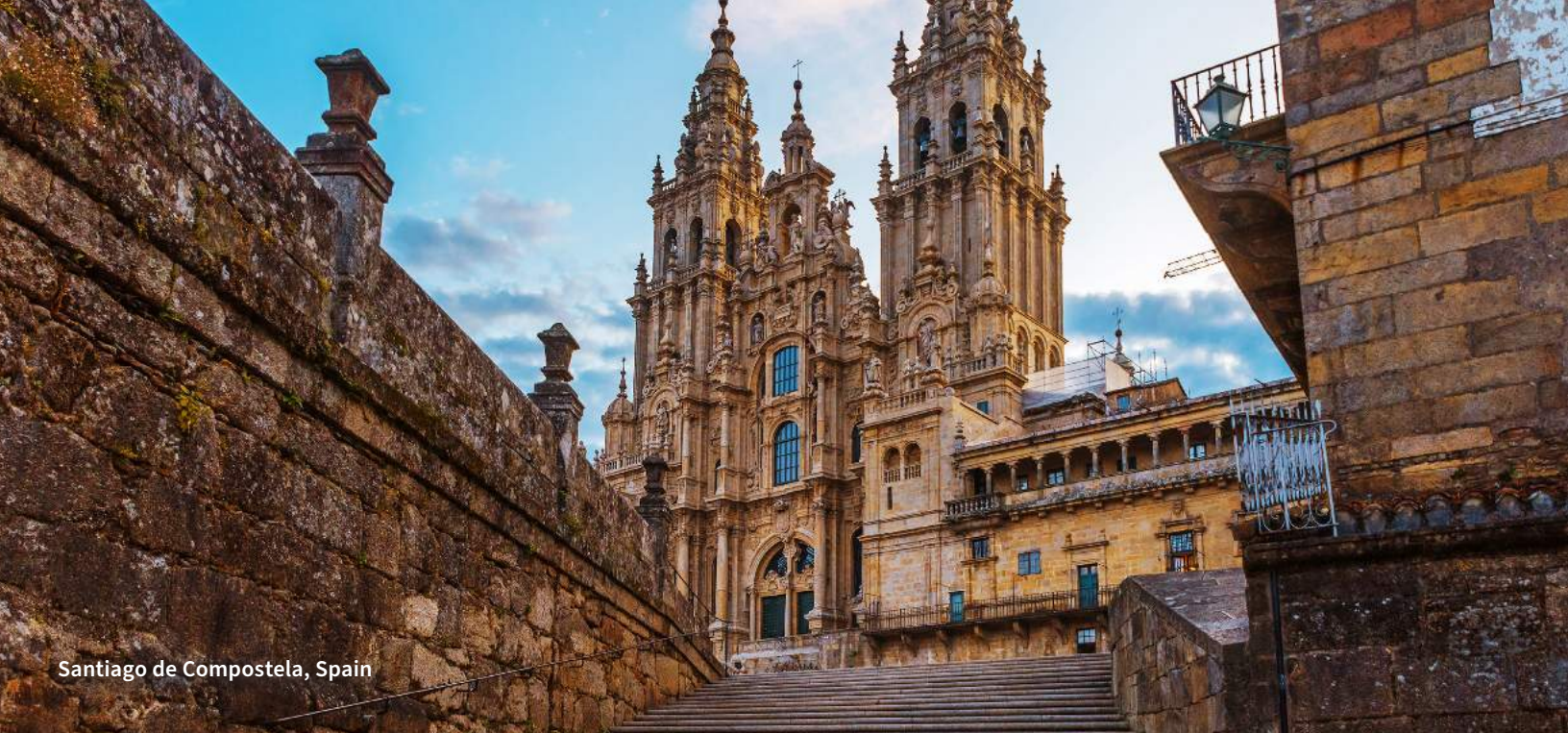
Santiago de Compostela, Spain