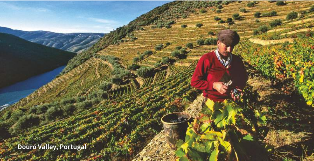
Douro Valley, Portugal